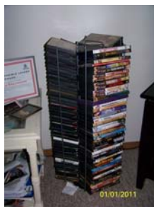
Figure 1. DVD tower.

contrary. The Walkers have a print-saturated home. Just as Johnson (2010) noted in her study of an intergenerational African American family, the Walkers use literacy for multiple purposes. Their literacy uses include the following: